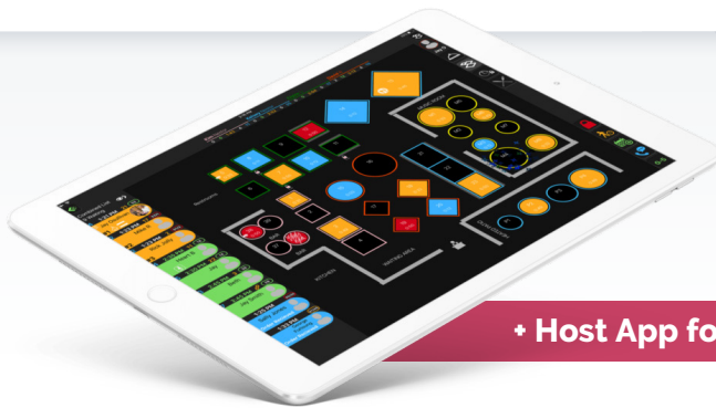
+ Host App for Ipad

Save between $800 and $1,200 per month compared to reservation platforms that charge per-cover fees.