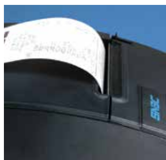
Liquid Guard Built Into the Cabinet Design