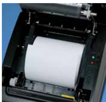
Drop and Print Paper Loading